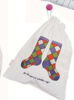
Left: 'Sock Check' 26 x 36cm