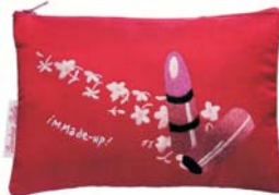
'I'm made up' 12 x18 cm