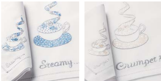
Napkins & Tea Towels