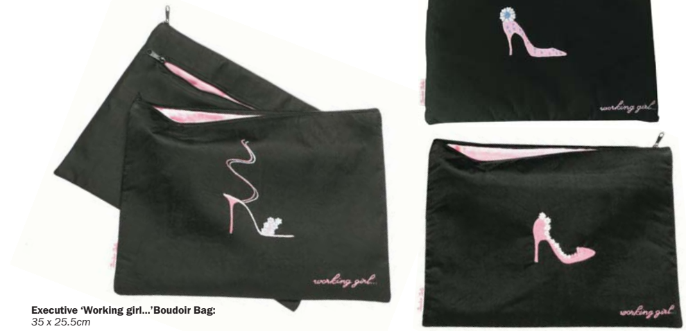
Executive 'Working girl...' Boudoir Bag: 35 x 25.5cm