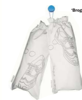
'Brogue Gallery' 16x39cm