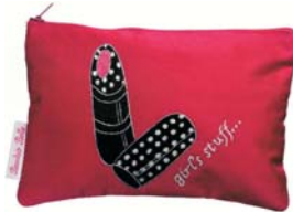
'Girls Stuff - Dots' 12 x18 cm