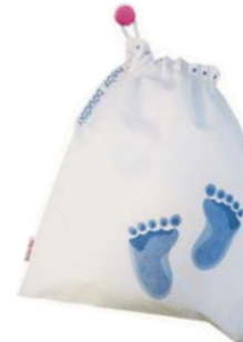
Baby feet 34x42cm