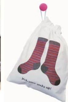
Far left: 'Sock Stripe' 26 x 36cm