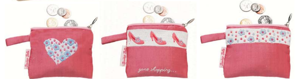
PURSE: 'Heart' 12 x 10cm