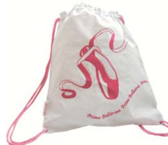
Pirouette rucksack 33x40cm