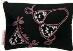
'Bikini' 12 x18 cm