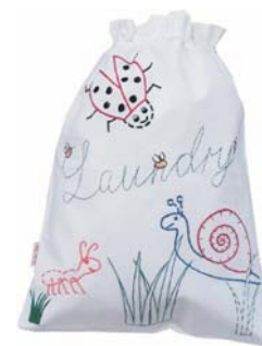
Bug Laundry bag 40x52cm