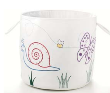
TOY BUCKET! 'Bug' 40cmx45cm