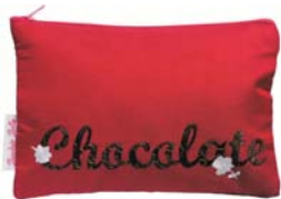
'Chocolate' 12 x18 cm