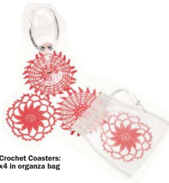
Crochet Coasters: x4 in organza bag