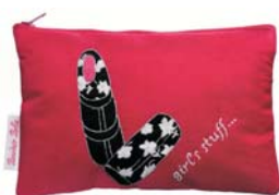
'Girls Stuff - Flowers' 12 x18 cm