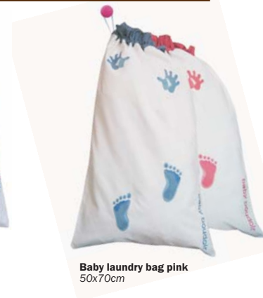
Baby laundry bag pink 50x70cm