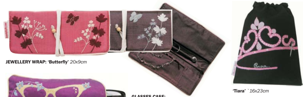
JEWELLERY WRAP: 'Butterfly' 20x9cm