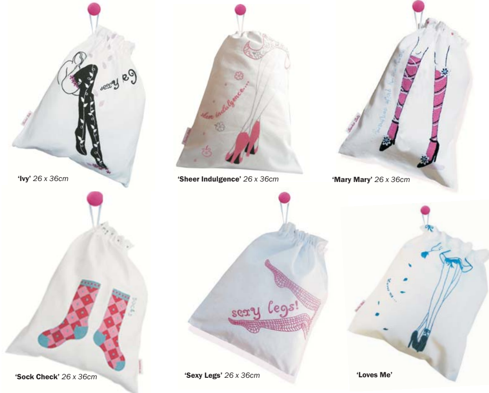
'Ivy' 26 x 36cm