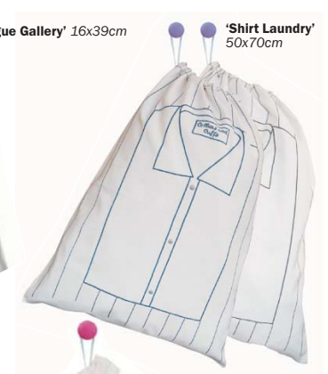
'Shirt Laundry' 50x70cm