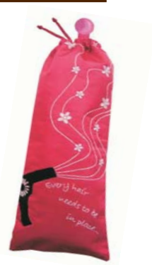
Hair straightener/brush bag 15x38cm