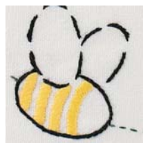
Animals and insects...