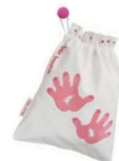
Baby Hands 20 x 26cm