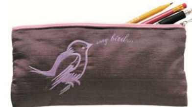
PENCIL CASE: 'Song bird' 23x10cm