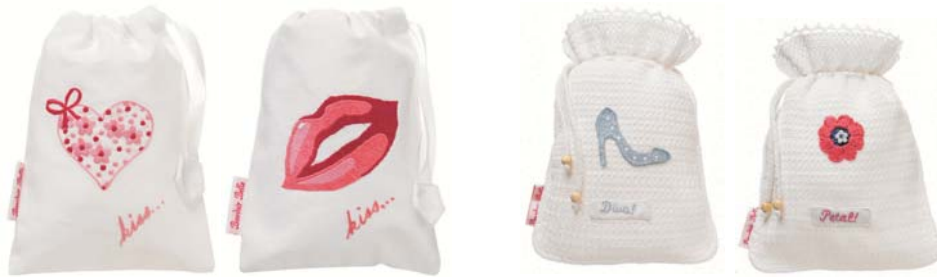
'Heart' 12 x 18 cm