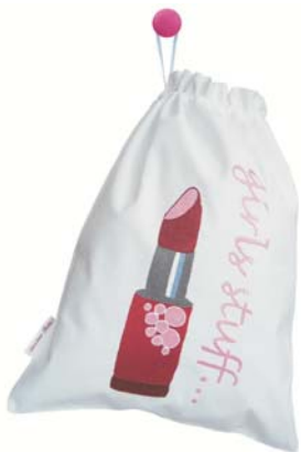
'Girls stuff' 26x36cm