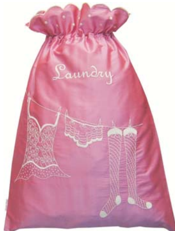
'Laundry line' 50x70cm